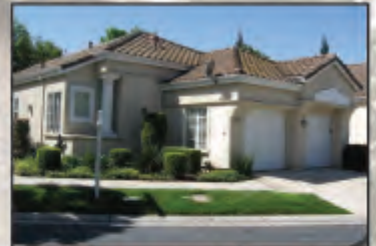
3838 Annadale Ct. $449,950

Fabulous 4432 sqft. custom home overlooking the 2nd fairway of Brookside golf course, 4 bed 4 bath. Elegant master suite downstairs, 2 suites upstairs, huge open & flowing floorplan, rich walnut, mahogany and fir hardwoods throughout, wine storage, private balcony, Wonderful secluded bbq area, sophisticated yet comfortable.