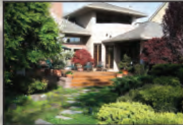
3626 Gleneagles Dr. $1,695,000

The prestigious area of Morada. 6093 sqft., bedrooms include a luxurious master suite, a unique Jack & Jill bedroom as well as a private area devoted to a second family room with a bedroom and bathroom. Lush landscaping includes a koi pond with a rock waterfall and a fabulous pool.