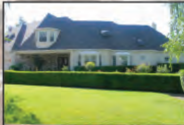
5660 Acorn Ct. $1,395,000

Custom built, 2nd largest lot in area, vaulted ceiling, newer paint, ceiling fans in all rooms, wine storage, view of lake from master suite, sitting room & bath w/sliding door to patio on lake in 2nd suite, 3rd suite with large walk-in, 4th room/office with custom window box, attic storage & boat dock, full RV garage.