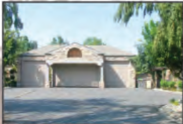
2390 Pheasant Run $895,000

Custom built, 2nd largest lot in area, vaulted ceiling, newer paint, ceiling fans in all rooms, wine storage, view of lake from master suite, sitting room & bath w/sliding door to patio on lake in 2nd suite, 3rd suite with large walk-in, 4th room/office with custom window box, attic storage & boat dock, full RV garage.