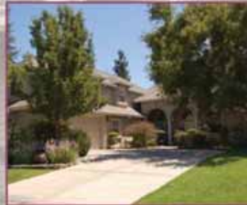
4334 Saint Andrews $1,169,945

Classic lake front, sunny & bright, brand new carpeting, wonderful tile & upgrades. 2 master suites 1 downstairs & 1 upstairs w/ fireplace.