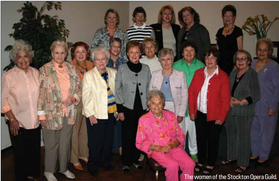
The women of the Stockton Opera Guild.