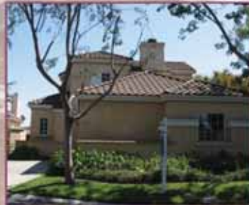
4324 Heron Lakes $629,500

Private oversized cul-de-sac lot, upgrades include granite countertops, plantation shutters, stamped concrete patio & dog run.