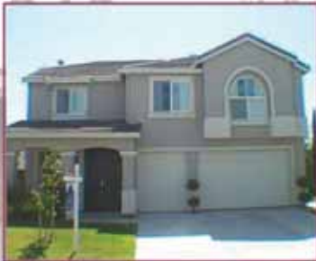
5028 Pine Lake $559,945

Private oversized cul-de-sac lot, upgrades include granite countertops, plantation shutters, stamped concrete patio & dog run.