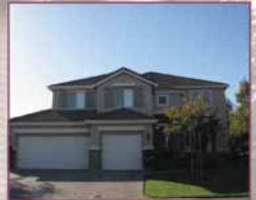
5205 Poppy Hills $849,500

Custom home, vaulted ceiling, elegant formal living & dining rooms, oversized 700 sq ft bonus room, private backyard w/ gas fire pit.